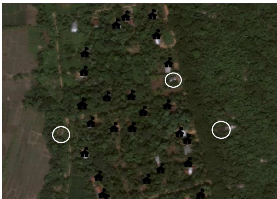
Figure 2 Screenshot of identification of missing households. The figure illustrates how by using Google Earth (Earth data: Google, DigitalGlobe) and the GPS data, the progress of data collection can be monitored. The locations of completed household surveys are marked using house icons. The households circled in white are households which were missed. The supervisors were able to direct data collectors by using these maps, to ensure that all households were approached.

coverage was not possible the following day, especially if the backup battery store was also affected.