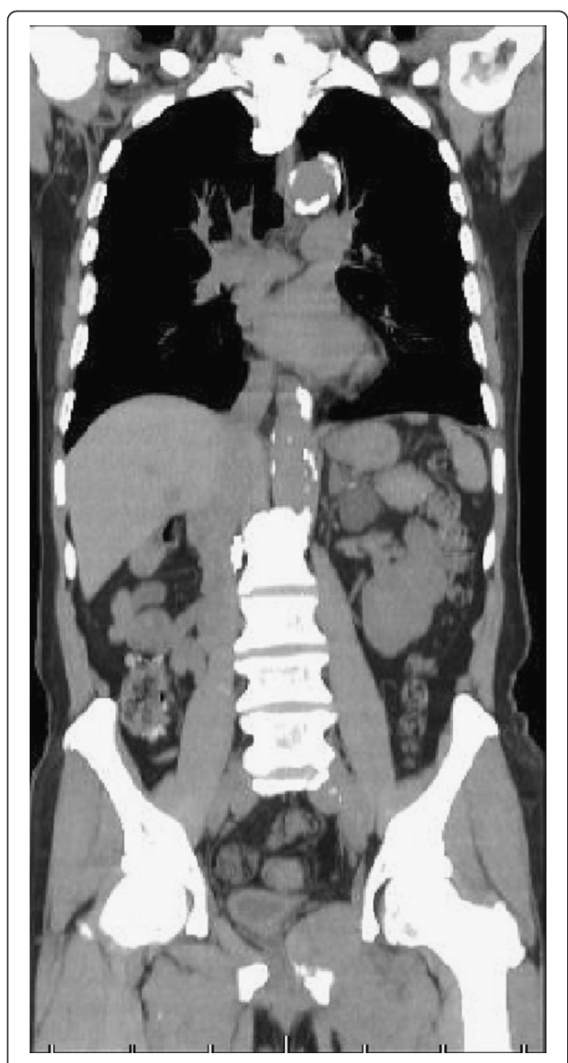
Figure 3 There was no evidence of inferior vena cava involvement.

These reports showed that right heart metastasis tended to be associated with absence of metastasis to other organs. Conversely, left heart metastasis tended to be associated with other organ metastases, although no significant correlation between disease side and multifocality was evident (p = 0.346) [2-12].